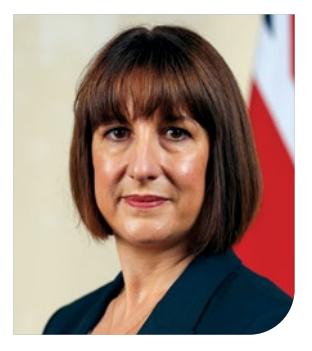
Official portrait of Rachel Reeves MP

Other significant tax increases included higher capital gains tax rates and a future reduction in inheritance tax business and agricultural reliefs. Despite the additional revenue, the Office for Budget Responsibility (OBR) projects that increased spending will mean that borrowing will still be over £70 billion in 2029/30. Not without reason does the OBR say, "...this Budget delivers a large, sustained increase in spending, taxation, and borrowing".